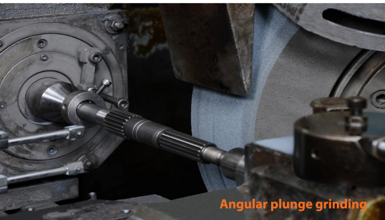
Angular plunge grinding

We manufacture precision machined automotive components for a variety of applications, including transmission, steering system, fuel injection, hydraulic systems and auto electrical. Our product range includes machined castings and forgings, splined shafts, pinions, sprockets.