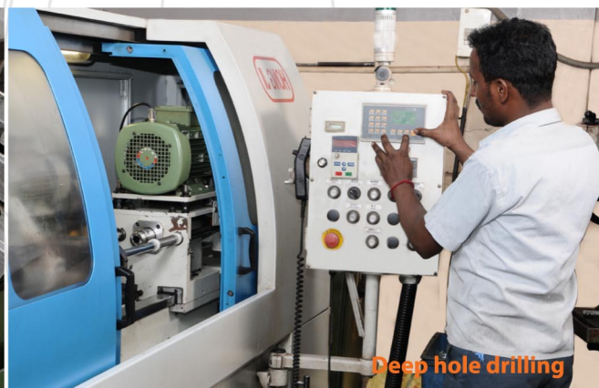
Deep hole drilling