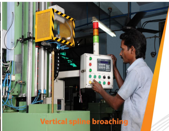
Vertical spline broaching