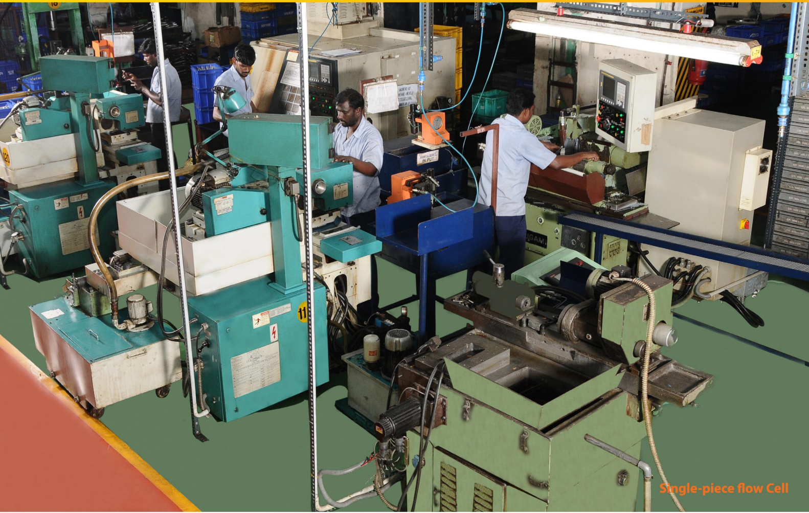
Single-piece flow Cell